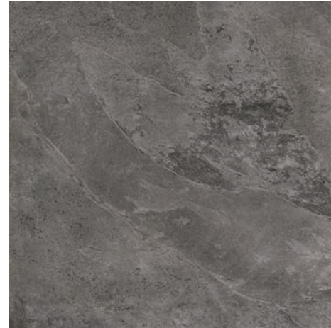
2XSLAN60R7 – Antracite 23.5" X 23.5" Sq.Ft: $16.95 – Pc: $65.09