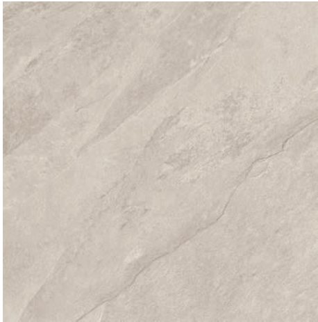
2XSLGR60R4 – Grigio 23.5" X 23.5" Sq.Ft: $16.95 – Pc: $65.09