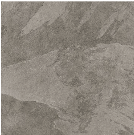
2XSLPI60R4 – Piombo 23.5" X 23.5" Sq.Ft: $16.95 – Pc: $65.09