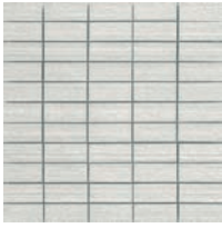
CEMBIMOS - Bianco Cassero 1 x 2.5" - 12" x 12" mesh Sq.Ft.: $44.95 – Sheet: $43.22