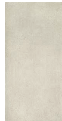
CEMBE1224R - Beige Rasato 11.75" x 23.75" Sq.Ft.: $8.95 – Pc: $17.36