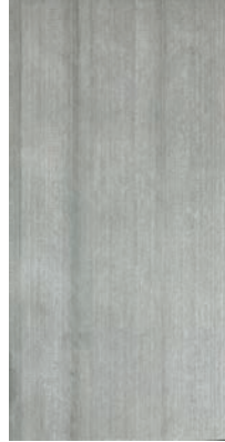
CEMGR1224C - Grigio Cassero 11.75" x 23.75" Sq.Ft.: $8.95 – Pc: $17.36