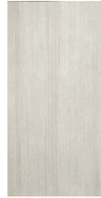
CEMBE1224C - Beige Cassero 11.75" x 23.75" Sq.Ft.: $8.95 – Pc: $17.36