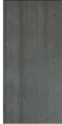
CEMAN1224C - Antracite Cassero 11.75" x 23.75" Sq.Ft.: $8.95 – Pc: $17.36