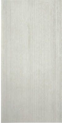
CEMBI1224C - Bianco Cassero 11.75" x 23.75" Sq.Ft.: $8.95 – Pc: $17.36