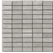
CEMGRMOS - Grigio Cassero 1 x 2.5" - 12" x 12" mesh Sq.Ft.: $44.95 – Sheet: $43.22