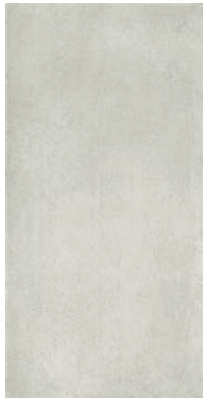
CEMBI1224R - Bianco Rasato 11.75" x 23.75" Sq.Ft.: $8.95 – Pc: $17.36