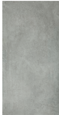
CEMGR1224R - Grigio Rasato 11.75" x 23.75" Sq.Ft.: $8.95 – Pc: $17.36