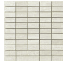
CEMBEMOS - Beige Cassero 1 x 2.5" - 12" x 12" mesh Sq.Ft.: $44.95 – Sheet: $43.22