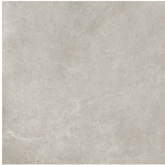
EPPE24 – Pearl 23.5" x 23.5" Sq. Ft.: $11.95 – Pc.: $45.89