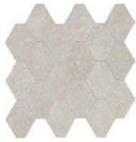
EPPELOS – Pearl Losanga 4"x 3.5" 12.75" x 12.5" mesh Sq. Ft.: $54.95 – Pc.: $57.70