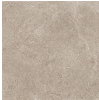
EPCA24 – Caramel 23.5" x 23.5" Sq. Ft.: $11.95 – Pc.: $45.89