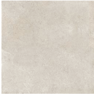
EPSH24 – Shell 23.5" x 23.5" Sq. Ft.: $11.95 – Pc.: $45.89