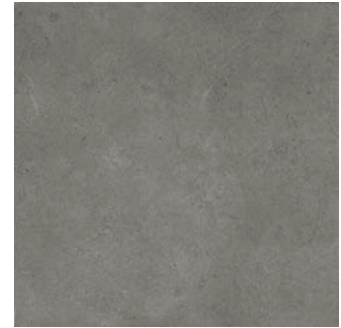
EPGR24 – Grey 23.5" x 23.5" Sq. Ft.: $11.95 – Pc.: $45.89