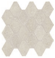
EPSHLOS – Shell Losanga 4"x 3.5" 12.75" x 12.5" mesh Sq. Ft.: $54.95 – Pc.: $57.70