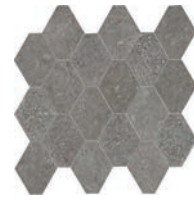
EPGRLOS – Grey Losanga 4"x 3.5" 12.75" x 12.5" mesh Sq. Ft.: $54.95 – Pc.: $57.70