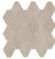
EPCALOS – Caramel Losanga 4"x 3.5" 12.75" x 12.5" mesh Sq. Ft.: $54.95 – Pc.: $57.70