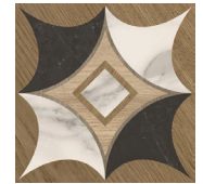
IEL88P1 Elite pattern #1 7.75" x 7.75" Sq. Ft.$15.95 - Pc. $6.79