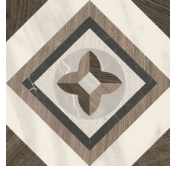
IGL88P2 Glam pattern #2 7.75" x 7.75" Sq. Ft.$15.95 - Pc. $6.79