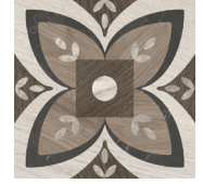
IGL88P3 Glam pattern #3 7.75" x 7.75" Sq. Ft.$15.95 - Pc. $6.79