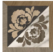
IEL88P2 Elite pattern #2 7.75" x 7.75" Sq. Ft.$15.95 - Pc. $6.79