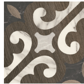
IGL88P5 Glam pattern #5 7.75" x 7.75" Sq. Ft.$14.50 - Pc. $6.17