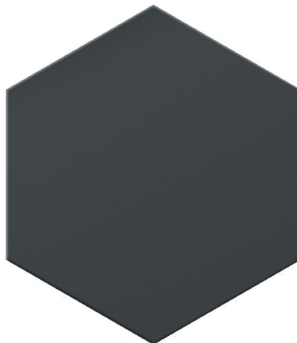
TMABLHEX - Black 8" X 9.5" Sq. Ft.: $10.95 - Pc: $4.93