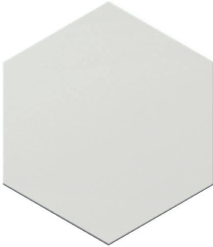
TMAWHHEX - White 8" X 9.5" Sq. Ft.: $10.95 - Pc: $4.93