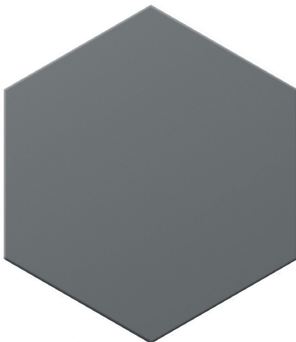
TMAGRHEX - Grey 8" X 9.5" Sq. Ft.: $10.95 - Pc: $4.93