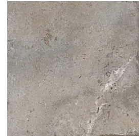
DSS9970R - dark 36" X 36" natural Sq.Ft.: $13.95 – PC.: $121.65