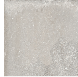
DSS9940R - grey 36" X 36" natural Sq.Ft.: $13.95 – PC.: $121.65