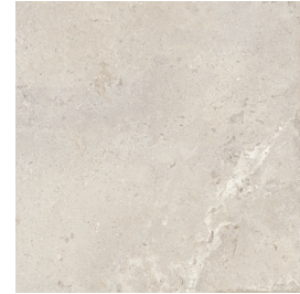
DSS9920R - beige 36" X 36" natural Sq.Ft.: $13.95 – PC.: $121.65