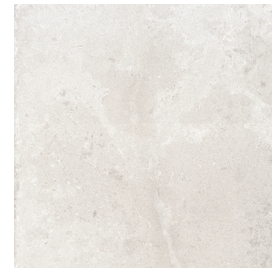
DSS9910R - white 36" X 36" natural Sq.Ft.: $13.95 – PC.: $121.65