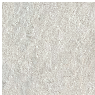
QR01-24N Glacier 23.5" x 23.5" Sq. Ft.: $12.95 Pc.: $50.25