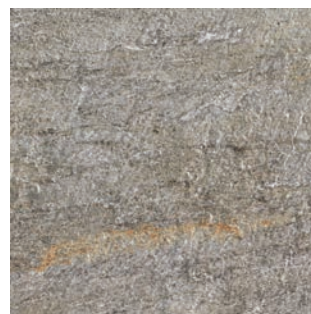
E2QR03-24S Waterfall 23.5" x 23.5" Sq. Ft. $18.95 Pc. $73.53