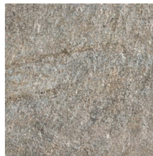
QR03-24N Waterfall 23.5" x 23.5" Sq. Ft.: $12.95 Pc.: $50.25