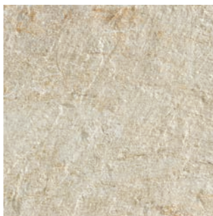
QR02-24N Mountain 23.5" x 23.5" Sq. Ft.: $12.95 Pc.: $50.25