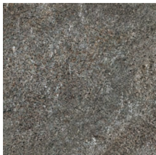
QR04-24N River 23.5" x 23.5" Sq. Ft.: $12.95 Pc.: $50.25