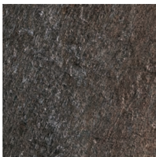
E2QR05-24S Mantle 23.5" x 23.5" Sq. Ft. $18.95 Pc. $73.53