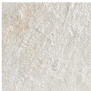
E2QR01-24S Glacier 23.5" x 23.5" Sq. Ft. $18.95 Pc. $73.53