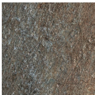
E2QR04-24S River 23.5" x 23.5" Sq. Ft. $18.95 Pc. $73.53