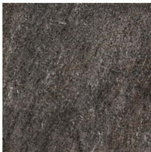
QR05-24N Mantle 23.5" x 23.5" Sq. Ft.: $12.95 Pc.: $50.25