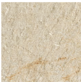
E2QR02-24S Mountain 23.5" x 23.5" Sq. Ft. $18.95 Pc. $73.53